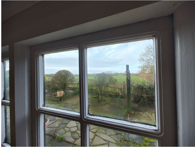
Ground floor view from south west to west - 1st hedgeline being runts lane, orchard way road on the right.