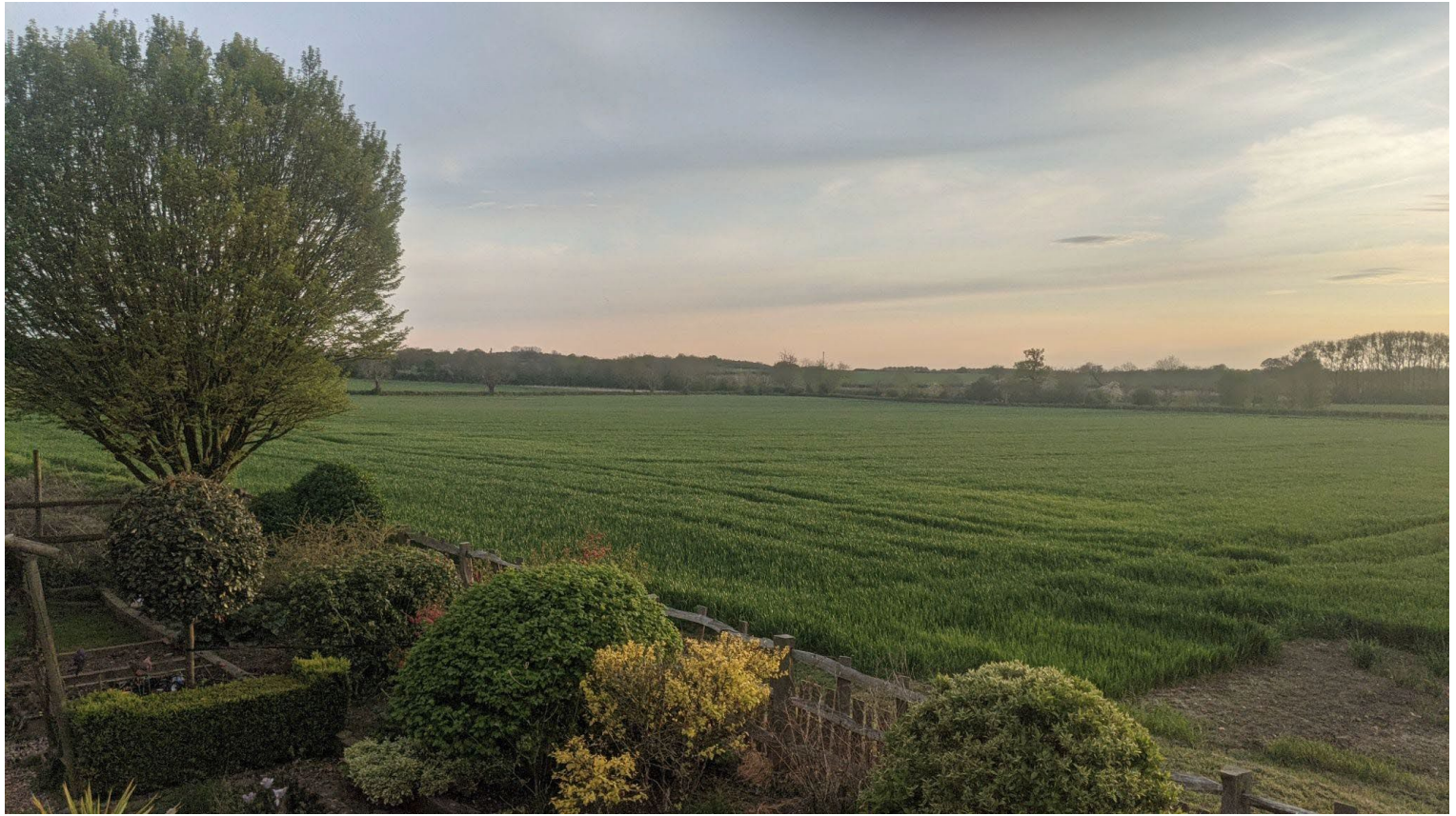
1st floor view south west