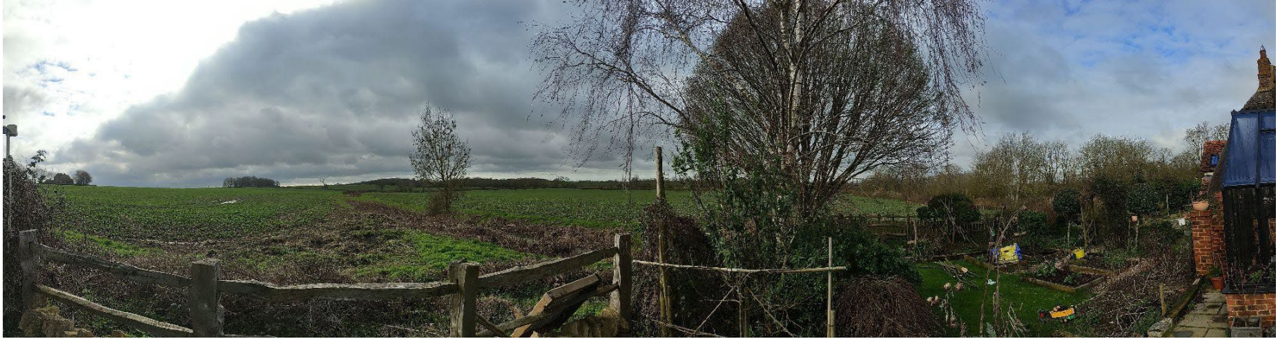
View south east to west - left hand edge is bernwood farm house - development is just above stag oak \frac{1}{3} in from left.