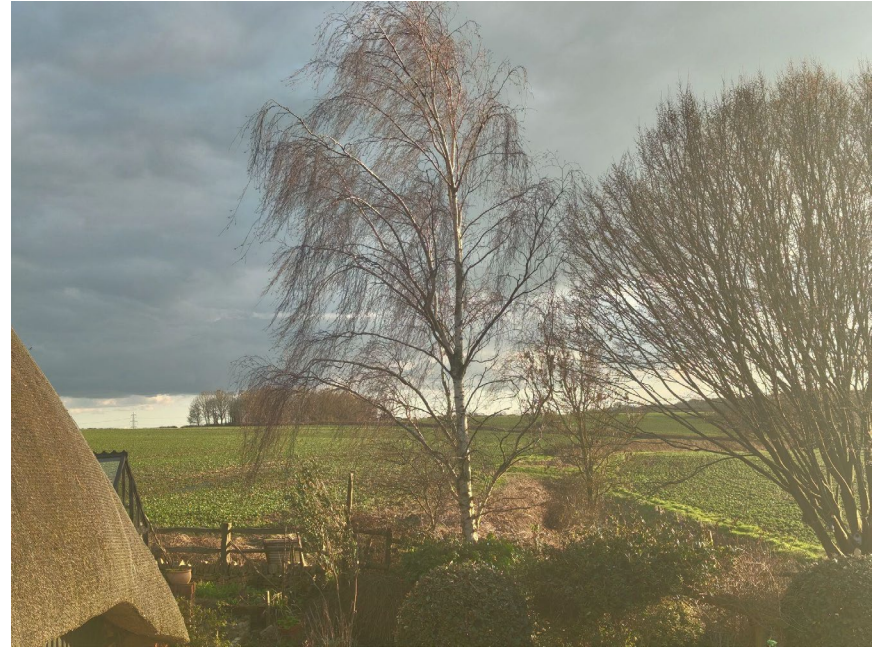
1st floor view south - copse in the BG is in line with proposed solar development